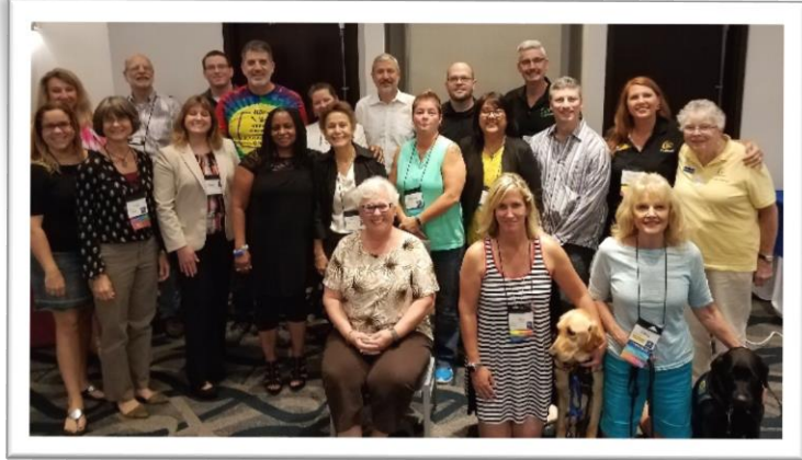
(ALDAcon 2017 Sponsors and Exhibitors Note: not all present at time of picture)