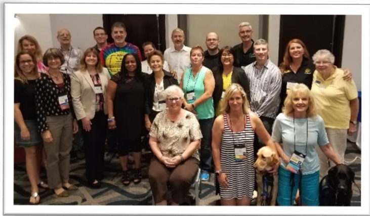
(ALDAcon 2017 Sponsors and Exhibitors Note: not all present at time of picture)